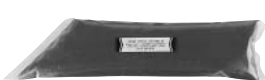
MODEL W7901 ▶ with Refill W790110 (shown above)